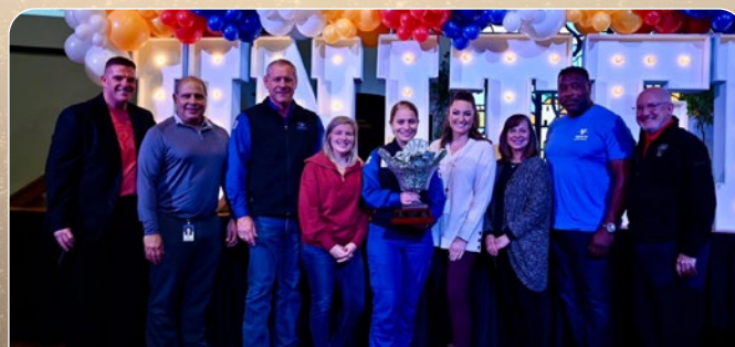
United Way of South Central OK Million Dollar Award