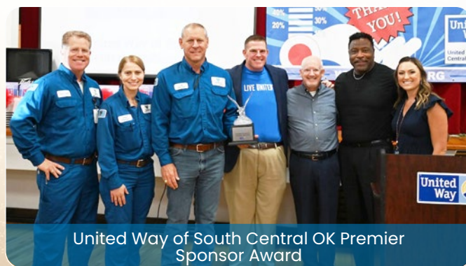
United Way of South Central OK Premier Sponsor Award

The Valero Chairman's Environmental Award recognizes a refinery that demonstrates the highest level of regulatory compliance combined with strong performance. This year the Ardmore Refinery received this Environmental Award for the second time, the first being in 2013. Last year, Ardmore had only one scorecard event. The site reduced scorecard events by 80% versus its prior five-year performance.