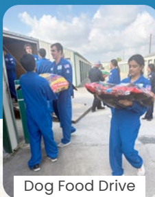
Dog Food Drive