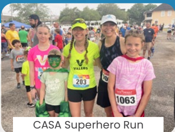
CASA Superhero Run